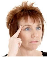
outside eye (oe)