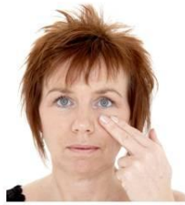
under eye (e)