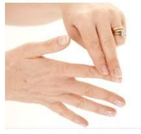
Index Finger (if)