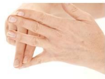
Tiny Finger (tf)