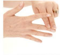
Middle Finger (mf)