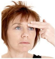
Eye Brow (eb)

Tap each point approx 15 times (3-4 seconds)