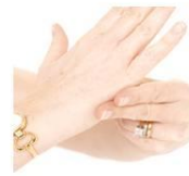
Side Hand (sh) or PR 1