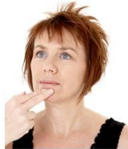
Under Lip (ul) or chin (ch)