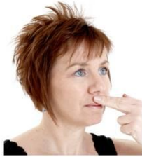
Under Nose (un)