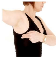
Under Arm (a)