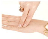
Gamut Spot (g)